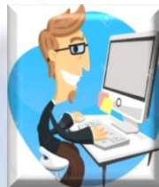
The Circle and the Triangle

Our Twelfth Step — carrying the message — is the basic service that the A.A. Fellowship gives; this is our principal aim and the main reason for our existence..